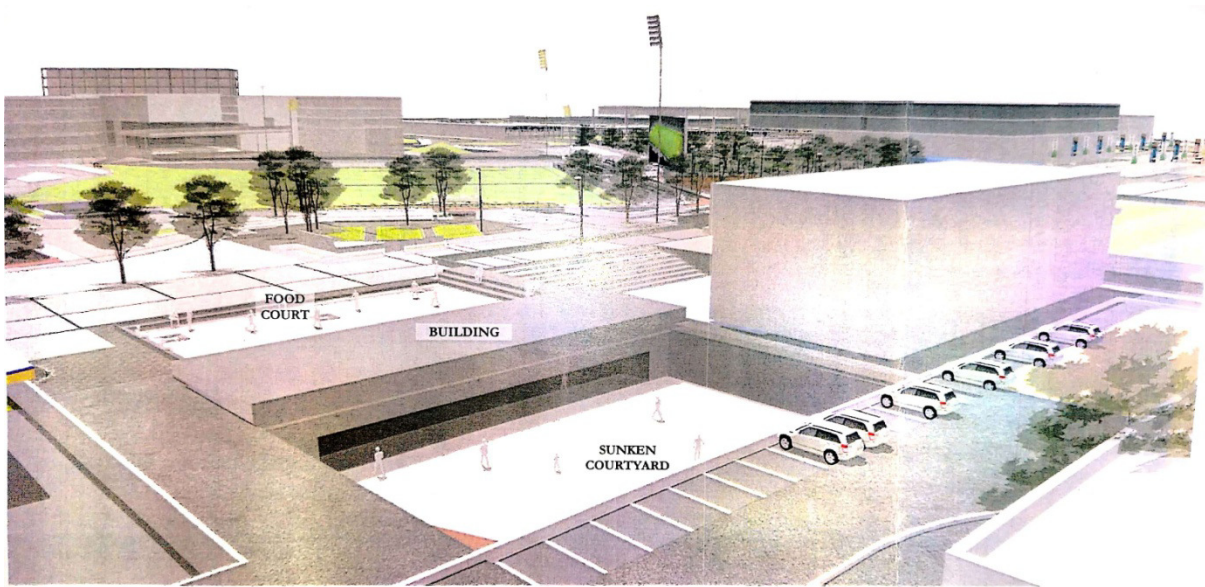
CS Scanned with CamScanner